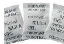
Silica Gel Sachets