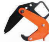
Pipe Lifting Clamp