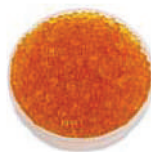
Orange Silica Gel