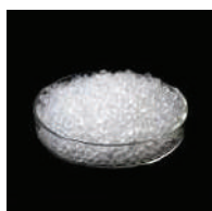
White Silica Gel

All offered products are widely appreciated because of their qualities such as longer shelf life, balanced composition, non-toxic nature, precise pH value & high performance & less consumption of our product. These provided products could be availed at low rate and are widely used in several industrial sectors.