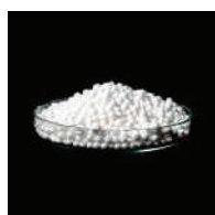
Activated Alumina Powder