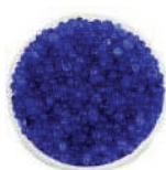
Blue Silica Gel