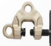
Safety Screw Clamp