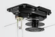
Ceiling Mount Winch