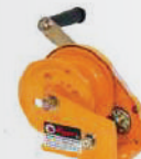
Brake Hand Winch

We supply high quality multi-purposes winch used for a wide variety of lifting and hoisting applications.