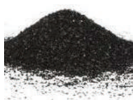
Activated Carbon Powder